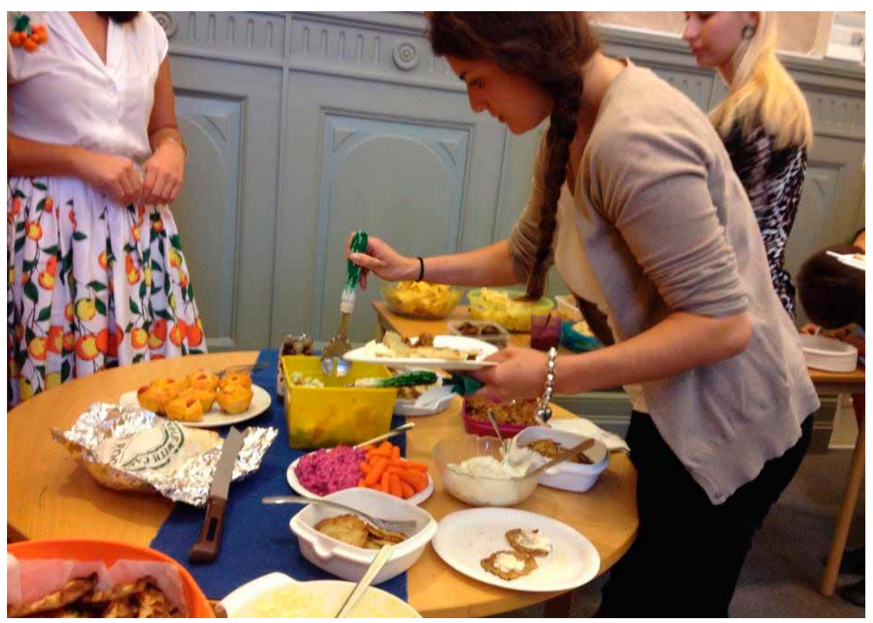
Some of the yummy food consumed at the potluck.

More information can be found on their websites: Student Health <a href="http://www.lunduniversity.lu.se/current-students/health-care/student-health-counselling">http://www.lunduniversity.lu.se/current-students/health-care/student-health-counselling</a> Student Chaplain <a href="http://studentprasterna.wordpress.com/in-english/">http://studentprasterna.wordpress.com/in-english/</a>