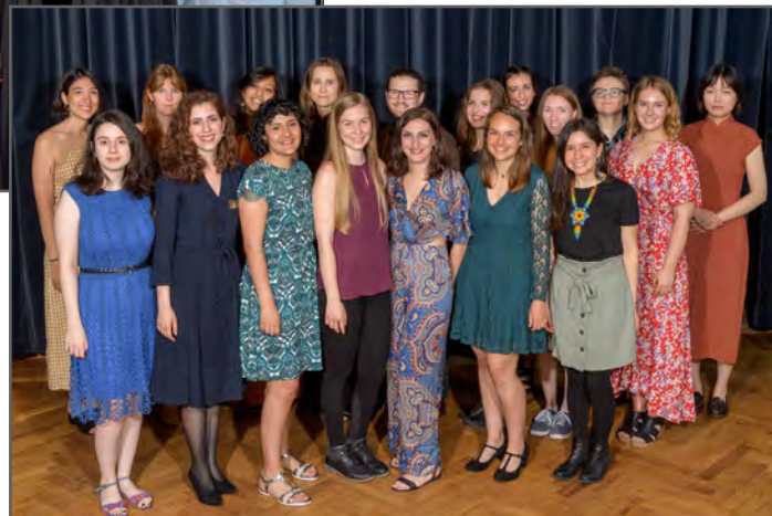
Graduating Social Studies of Gender students