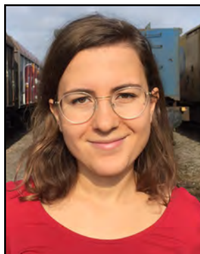
Bulëza Emerllahu Graduate School