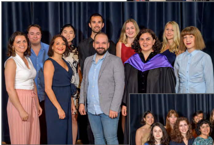
Graduating Middle Eastern Studies students