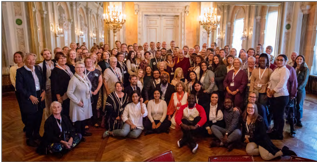
A photo of the whole office with the Dalai Lama for IM's 80th anniversary

The warnings about the irreversibility of global warming, the rising of extreme right-wing organizations, the accumulation of wealth in never-seen-before rates and the shrinking space for civil society were discussed during the meetings as well as during Fika – a favourite of Swedish work culture. In a more personal matter, I learned about the ways in which the work environment is different from my home country while also getting to practice my Swedish language skills. I got to explore and think about the relation between development, academia and activism and whether there should be a symbiotic relation or not.