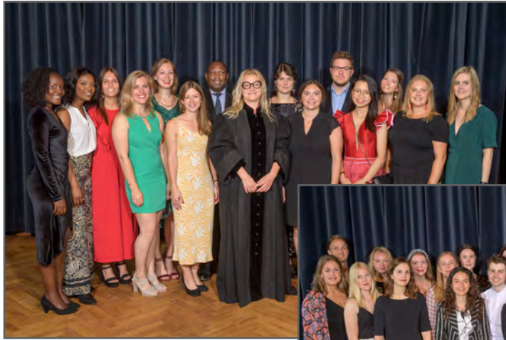
Graduating Development Studies students