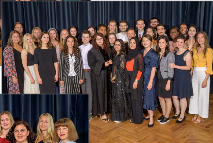
Graduating Global Studies students