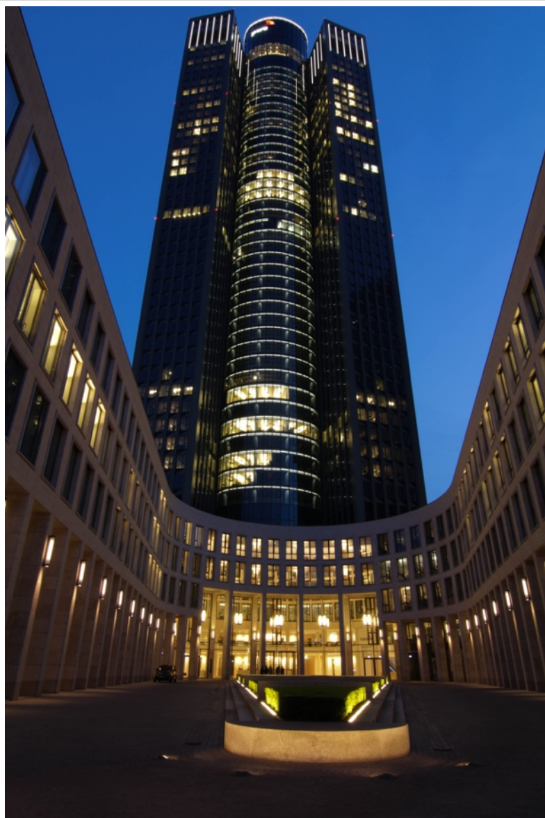
The PwC skyscraper in Frankfurt

My internship proved to me that even if a certain task or condition might at first seem completely overwhelming, it can be overcome by persistence and sometimes even just good timing. Right now, I am still working at PwC while simultaneously writing my Master's thesis – and I am really happy with my PwC experience as I plan to stay in consulting in the future.