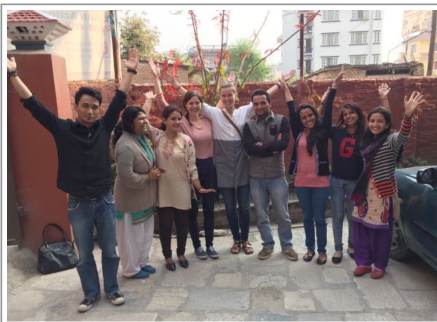
Nepali staff, and international volunteers at the Yuwalaya center after a workshop

With love and hope from the Yuwalaya team